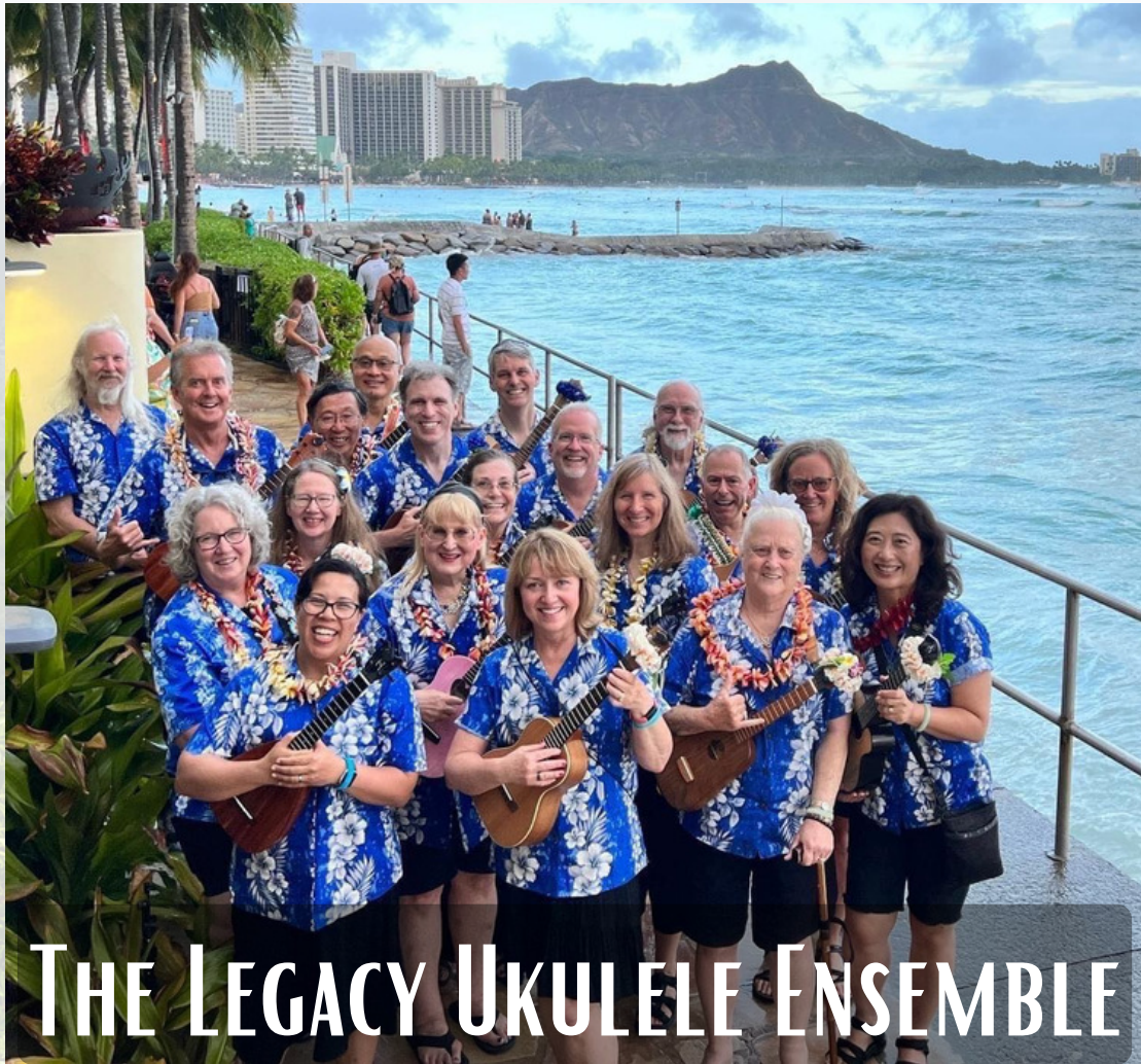
THE LEGACY UKULELE ENSEMBLE